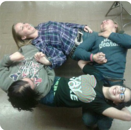
Below: Got to practice those balancing skills!