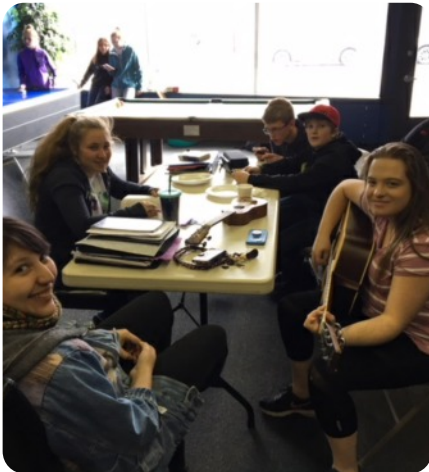
Above: Hanging out at City Life, getting our jam on!

PO Box 86, Madras, OR 97741 | Phone: (541) 475-6070 | office@centraloregonyfc.org